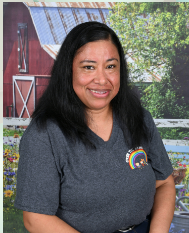
MS. FEBE- 2009